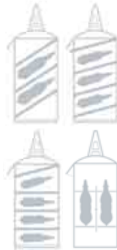
Typical partition layouts of HB510XL